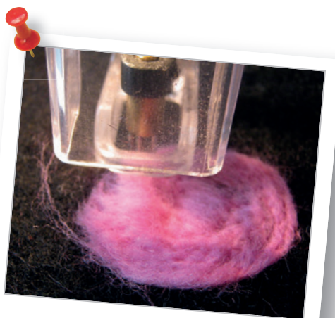
2. Embellish the circle of roving in circular movements.