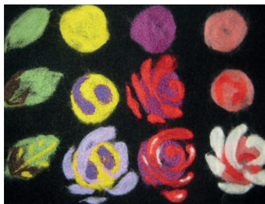
Finished flowers pressed with steam iron