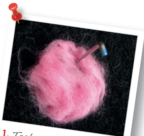
1. Tack a circle of roving in colour 1 onto base fabric using needle