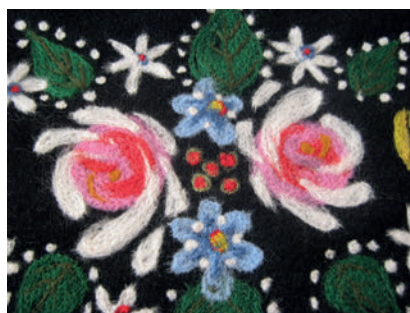
Romany roses pre steamed

Further embellish your project with embroidery stitches (machine or by hand) or beads.