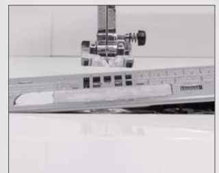
Computerised One Touch Needle Plate Converter

We reserve the right to change machine specifications without notice.