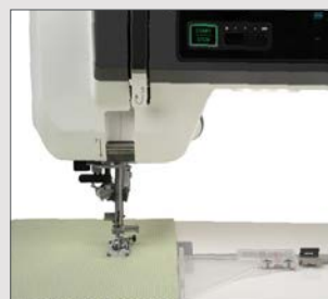
Metal Cloth Guide