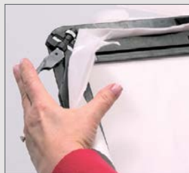
Easy Tightening Lever

Advanced tools give advanced abilities for creative expression. The Continental M17 includes a great tool for creativity: Variable Zigzag. This feature enables precision control over the stitch width via the knee lift. Thread painters will rejoice at the ease of control of the stitch width. Begin with a straight stitch, then while the machine is still running, press against the knee lifter to widen your stitch to a 9mm Zigzag. Release pressure to gradually return to a straight stitch for a tapered finish. Don't want a 9mm stitch? You can easily control the maximum width of the stitch setting in the machine's set mode. This advanced control opens up amazing new possibilities for creative expression with free motion quilting, thread painting, raw edge applique, free motion monogramming, and more.