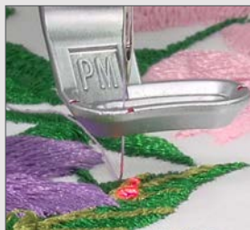
Embroidery Positioning Marker