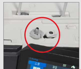
Independent Bobbin Winding Motor

The world's leading sewing machine manufacturer