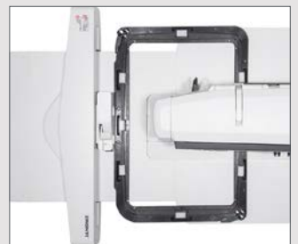
Extra-Large Embroidery Area

The world's leading sewing machine manufacturer