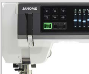
Automatic Thread Cutter

The Continental M17 features an extra-large foot control for greater stability and surface area when sewing. The Thread Cutter Pedal is also included, which allows you to snip your threads with your foot, so you don't have to remove your hands from your fabric. Both can be mounted on the included plate for easy access.