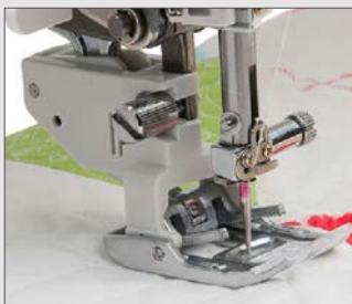
AcuFeed Flex Plus

Our largest hoops and embroidery area ever! Our RE46d Hoop offers 280 x 460mm (11" x 18.1") of embroidery area. Created with Carbon Fiber infused plastic, this large hoop is 10x stronger than metal! No other machine can offer such a large area, and guarantee the stability and precision of Janome embroidery, even when embroidering at speeds up to 1,200spm. Four included hoops have been created with a new easy-to-hoop lever system, as well as hoop size detection. Bonus Quilt Kit includes the AcuFil hoop, a great tool for quilting in the hoop.