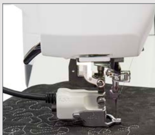
A.S.R. (Accurate Stitch Regulator)