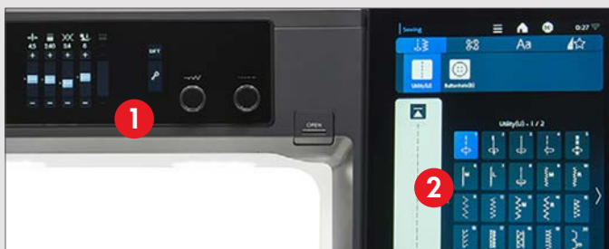
Two Advanced Capacitive Touchscreens

The new bobbin winder plate has five cutting blades. Faster and smoother winding, easy thread cutting, and your bobbin is ready to go!