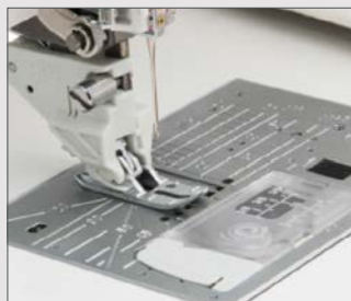
Professional Grade Needleplate