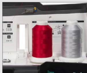
Retractable Spool Pins