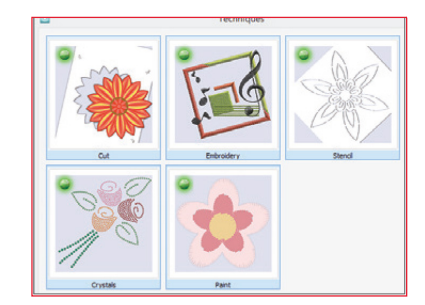
More than just embroidery: Create files for embroidery, paint, crystals, stencil and cutwork.

Software key login: Install the software an unlimited number of times, log in to use at any time.